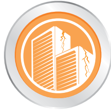
CONCRETE & STRUCTURAL REPAIR