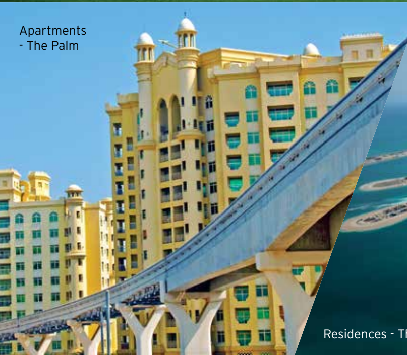
Apartments - The Palm