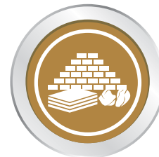
MARBLE & STONE PROTECTION