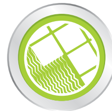
TILE ADHESIVES & GROUTS