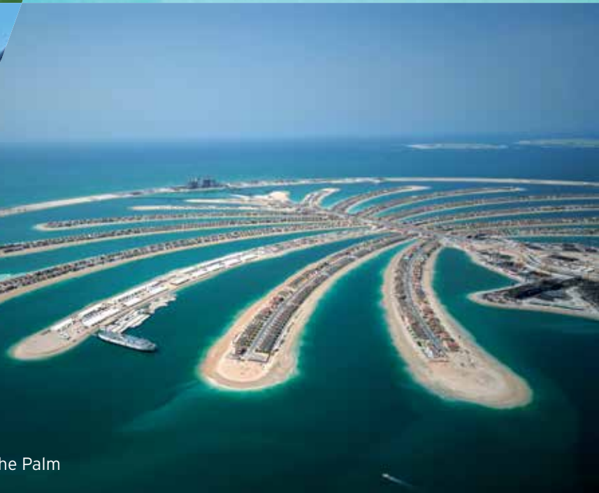
Residences - The Palm